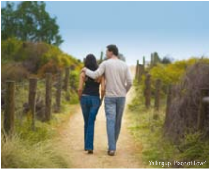
Yallingup Place of Love