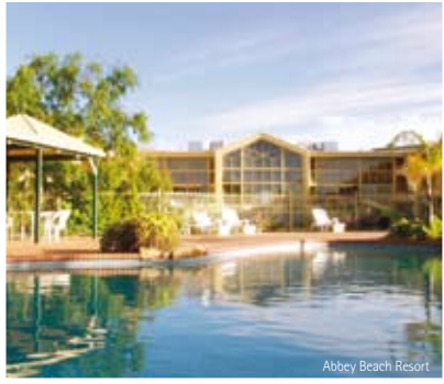
Abbey Beach Resort

For more information or to book your Romantic Escape call (618) 9752 1288 or visit www.geopraphebay.com