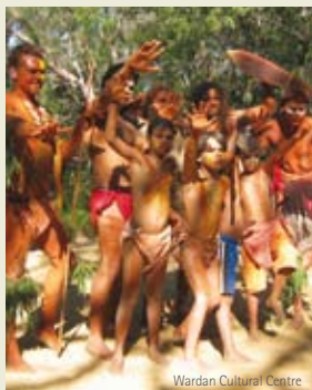
Wardan Cultural Centre