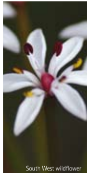
South West wildflower